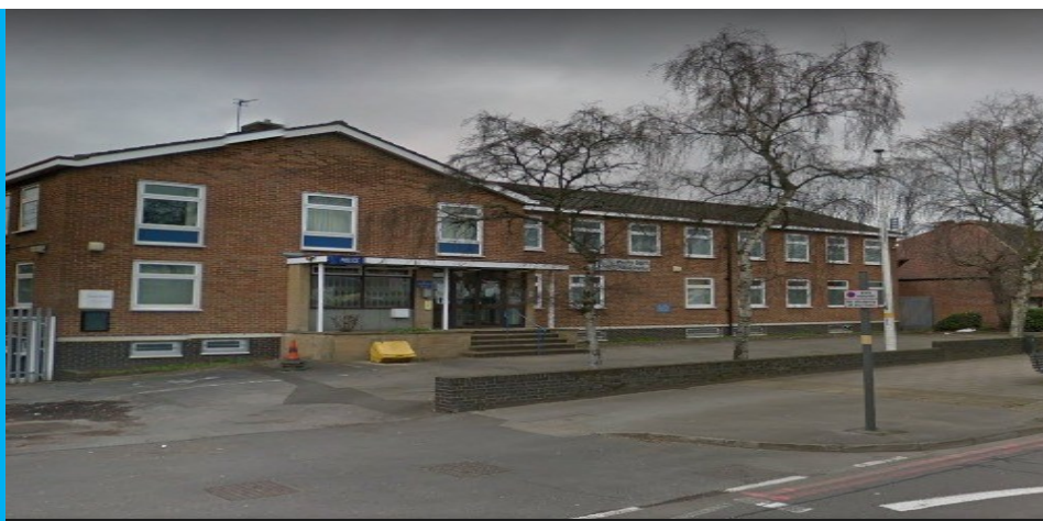
Great Barr Muslim Foundation, Walsall Rd

Protecting one's family from the fire refers to fostering a guiding environment for our families. The Prophet (ﷺ), too, stressed that we all actively help lead our families in the right direction. He (ﷺ) said: “Allah will ask every shepherd (or responsible person) about his flock (those for whom he was responsible), whether he took care of it or neglected it, until He asks a man about his household.”